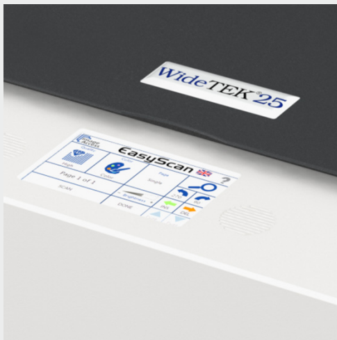
Large color touchscreen for simplified operation